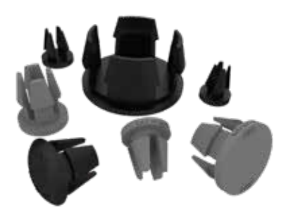
Hole Plugs.....PLP-0750B (Black) PLP-0750G (Gray)