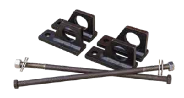
Jacking Kits Available for Purchase from McWane Poles